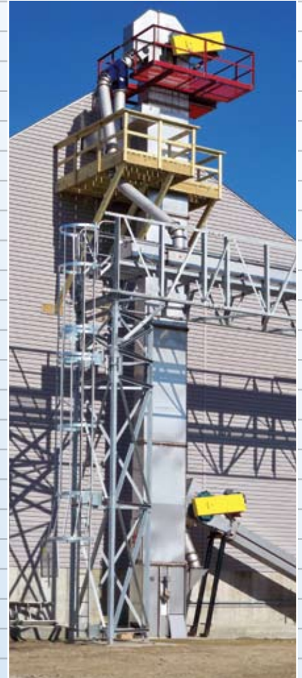
Retail Blend Plant

Sackett manufactures an extensive line of bucket elevators, including belt and chain types, centrifugal and continuous discharge, with cup styles including CCHD, AA, AC, D, DH and super capacity.