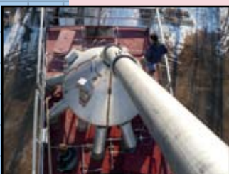
(L) Bucket elevator feeding blend tower distributor.

Our philosophy is to design and build bucket elevators that will go the long haul, because a higher initial price will cost less over the life of the elevator in terms of reduced down time and lower maintenance costs.