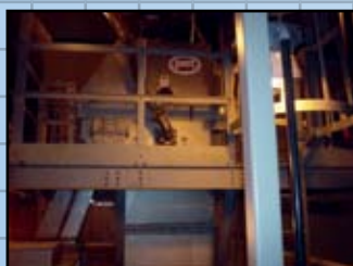
(R) Continuous elevator in ammonium sulfate process plant.